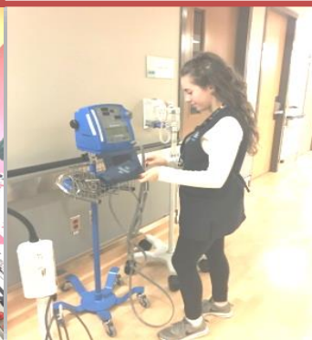
Birthing Unit-Mount Sinai